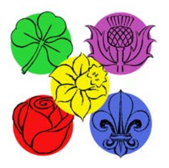
School House Logos